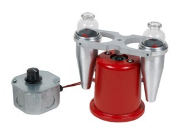
Model 574 - Stationary Type